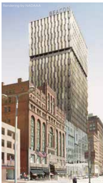
The Beacon apartments