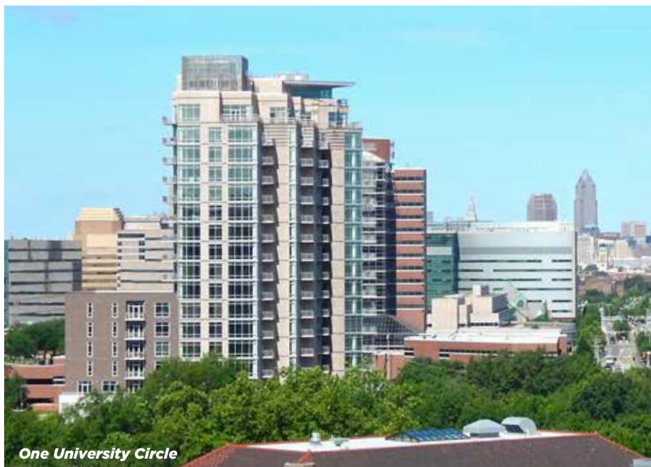
One University Circle