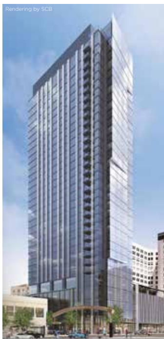
The Lumen apartments