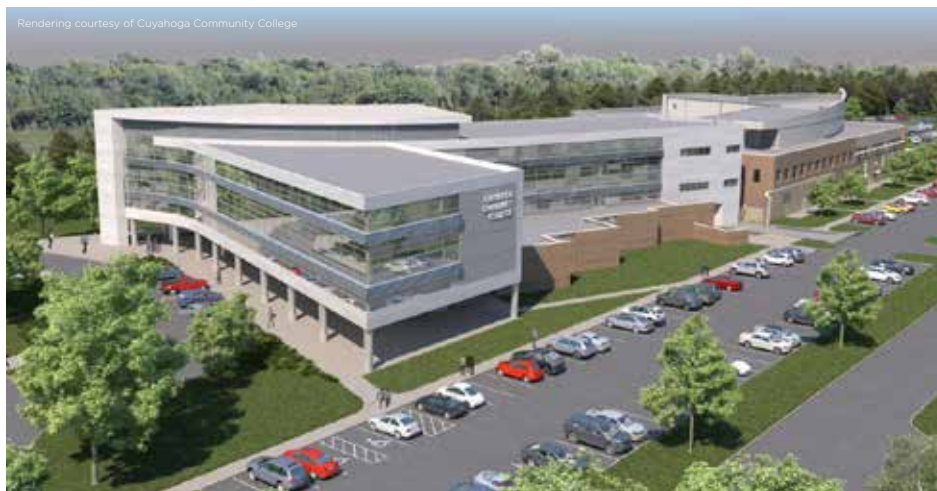
Tri-C Westshore Campus expansion