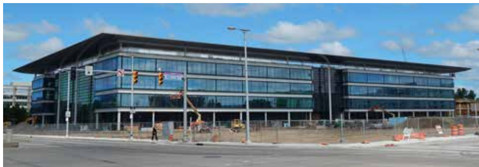
Cleveland Clinic CWRU Health Education Campus