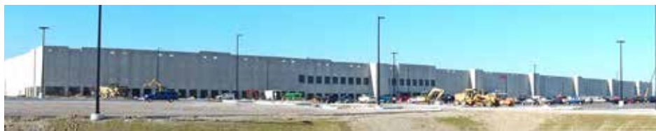
Amazon Fulfillment Center - North Randall