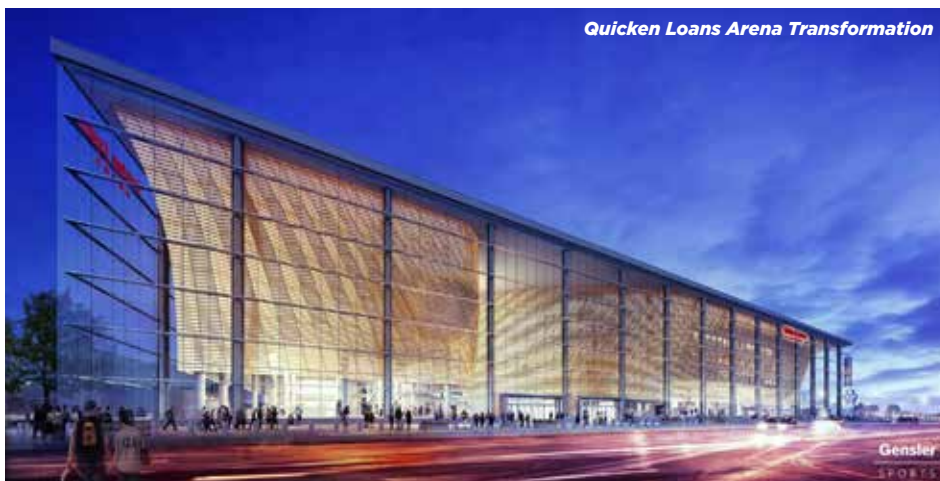
Quicken Loans Arena Transformation