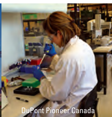
DuPont Pioneer Canada