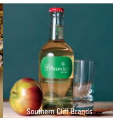
Southern Cliff Brands