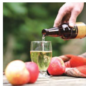
Spirit Tree Estate Cidery