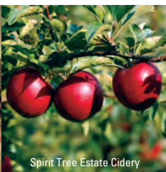
Spirit Tree Estate Cidery