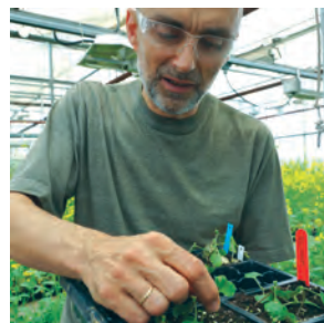
DuPont Pioneer Canada