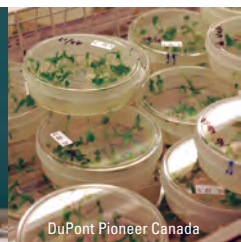
DuPont Pioneer Canada

Caledon, Ontario, Canada In the Heart of Canada's Food Processing Hub