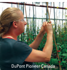
DuPont Pioneer Canada