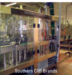
Southern Cliff Brands